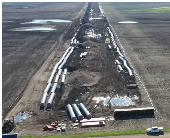
Stored Pipe on Site