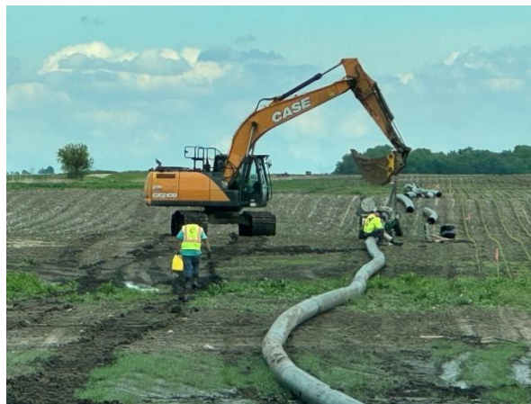
Placing Dewatering Pipe