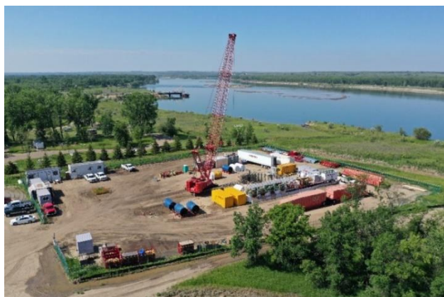
Site Under Construction

The project is closed, original contract price $18,896,900.00 with five change orders bringing the final contract price to $19,444,165.60.