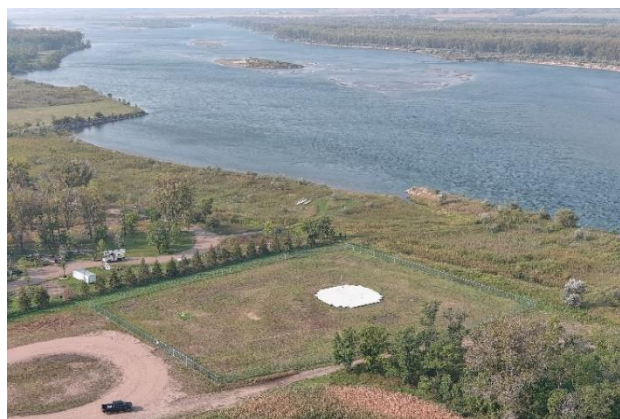
Completed Missouri River Intake