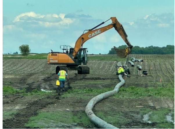
Placing Dewatering Pipe

The design team is also working with Reclamation and USFWS on routing the ENDAWS pipeline through wetland and other various existing easements.